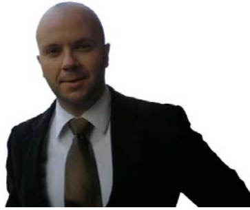
JAIME POZUELO-MONFORT 1 The Multidisciplinary European http://j.pozuelo-monfort.com